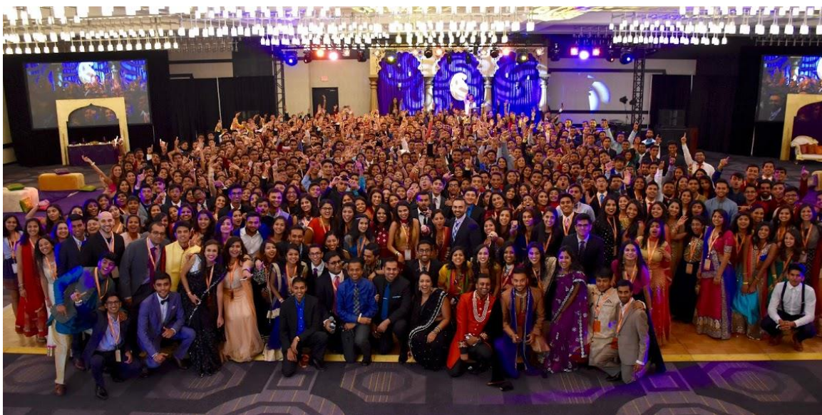
2016 YJA Convention - Los Angeles, CA

Subsidized registration fees for attendees include hotel accommodations, meals, souvenirs, and access to all events for the full 4-day Convention. Funds are also used to finance security, hospitality, transportation and travel assistance for attendees and speakers.