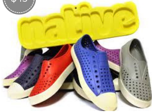
Native Shoes Jefferson