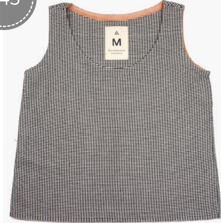
Luv.it Fashion Houndstooth Tank