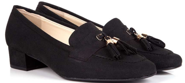
BeyondSkin Faux Suede Loafers