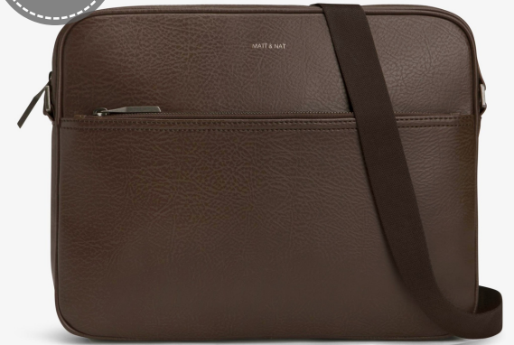
Matt and Nat Messenger Bag