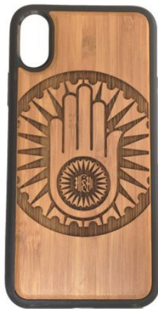
iMakeTheCase Ahimsa Phone Case