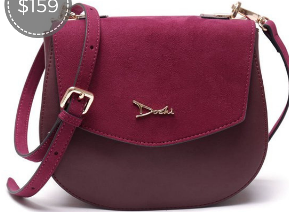
Doshi Saddle Bag